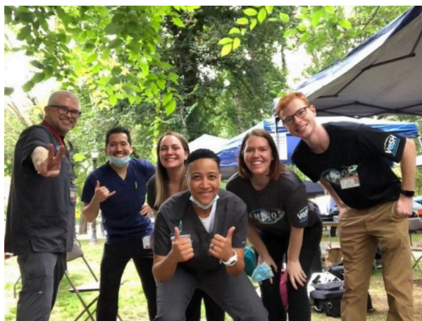
Day of Dignity PDX