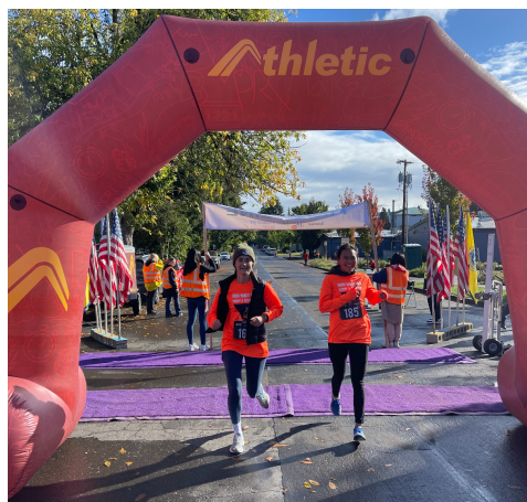
Lions Club Run