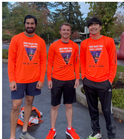
Lions Club Run

AMIGOS Eye Care was recognized as the 'Chapter of the Month' for August 2022 by VOSH International! This title was presented at the VOSH International meeting in San Diego.