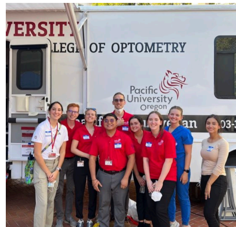
OHSU Health Equity Fair